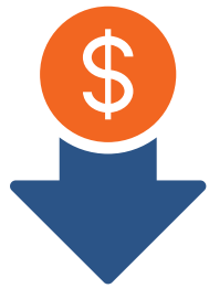
Chart an early bar exam action plan

Did you know that many states offer a reduced fee to students who apply for the bar exam during their 1L or 2L year? Start by checking pre-registration requirements and discounts for the state in which you will be taking the bar exam. Stay up to date on early filing deadlines so you can fulfill all necessary requirements and possibly save some money.